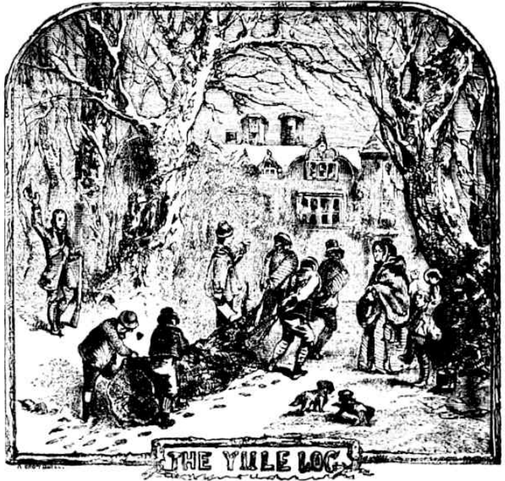
Collecting a Yule log from Chambers Book of Days (1832)

What follows is the period of time known as the 12 days of Christmas, which lasts roughly until 6th January in most Christian countries, although some Orthodox traditions celebrate it differently. At this time it is traditional to decorate homes with evergreen foliage from the woods, such as Holly, Ivy and sometimes Yew. Mistletoe is also a traditional accompaniment and these plants point to our more ancient traditions of honouring the endurance and eternal nature of life as we commune with our ancestors and guides, which I personally think is what this time of year was originally about. It is also traditional to have a Yule log, which was decorated with said