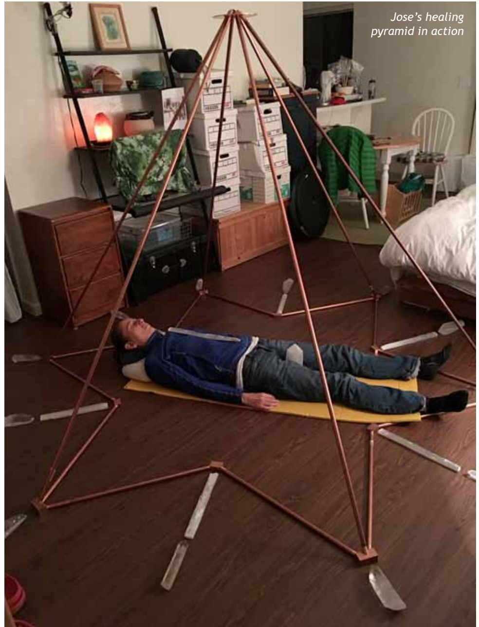
Jose's healing pyramid in action

That enlightening workshop was followed by four others with different teachers. In one of them I met Mary, a crystal healer who worked with pendulums. That was